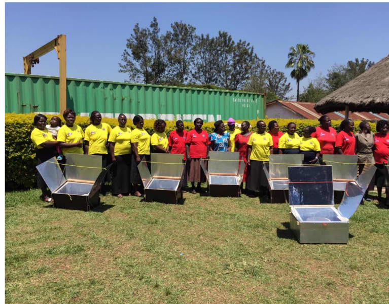
Area trainers in a class