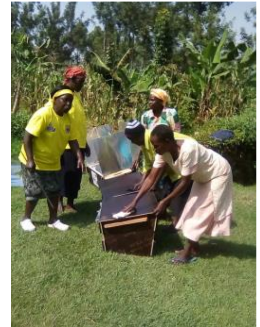
Trainees in the village