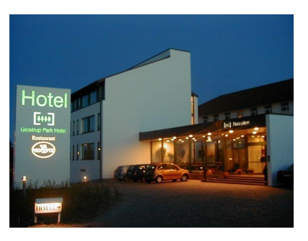
17 – 19 JANUARY 2020